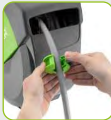
can be adjusted without tools