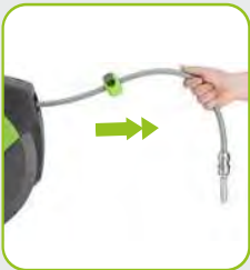
Infinitely variable locking mechanism