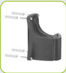
Incl. assembly kit and metal mount