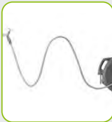
Supply hose 2 m