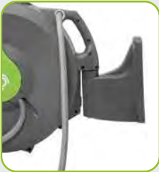
Plug-in option for supply hose