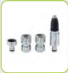
Incl. push-fit connector system made of metal