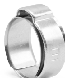
One Ear with Inner-Ring